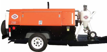
The Mighty 'Buster Blaster' Unit

Soda blasting is a relatively new process. Developed in The USA; our process, blast media and equipment have been refined to the extent that it is all fully purpose specified and built achieving very high effectiveness and efficiency levels. The process has been used by us for a number of years now in New Zealand with many satisfied clients over a wide range of applications.